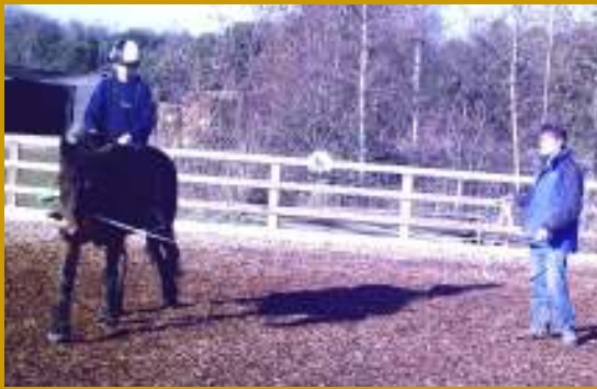
Lessons in progress Top: Coulomb and Mendel Middle: Newton Bottom: Merlin Front: Merlin and Darwin